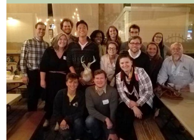
Planning Trivia Night 11/13/17