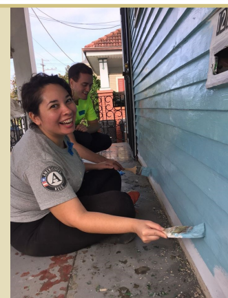
APA + PRC Rebuild 12.2.17