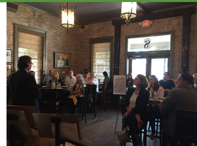
Downtown Covington Lunch & Walking Tour 10/26/17