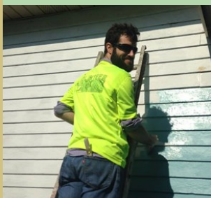
APA + PRC Rebuild 12.2.17

As a result of this major planning effort, 36 similarly resilient projects have been proposed in Terrebonne, St. Tammany, St. John the Baptist, Plaquemines, Lafourche, and Jefferson Parishes. Funding allocations and parish level strategic plans are expected in 2018. For more information, visit www.lasafe.la.gov .